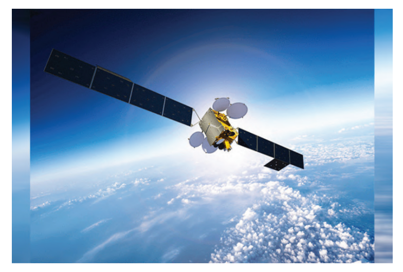
Measat has been operating since 1992. – Measat.com pic, September 14, 2021

Measat team members share their out-of-this-world career experiences