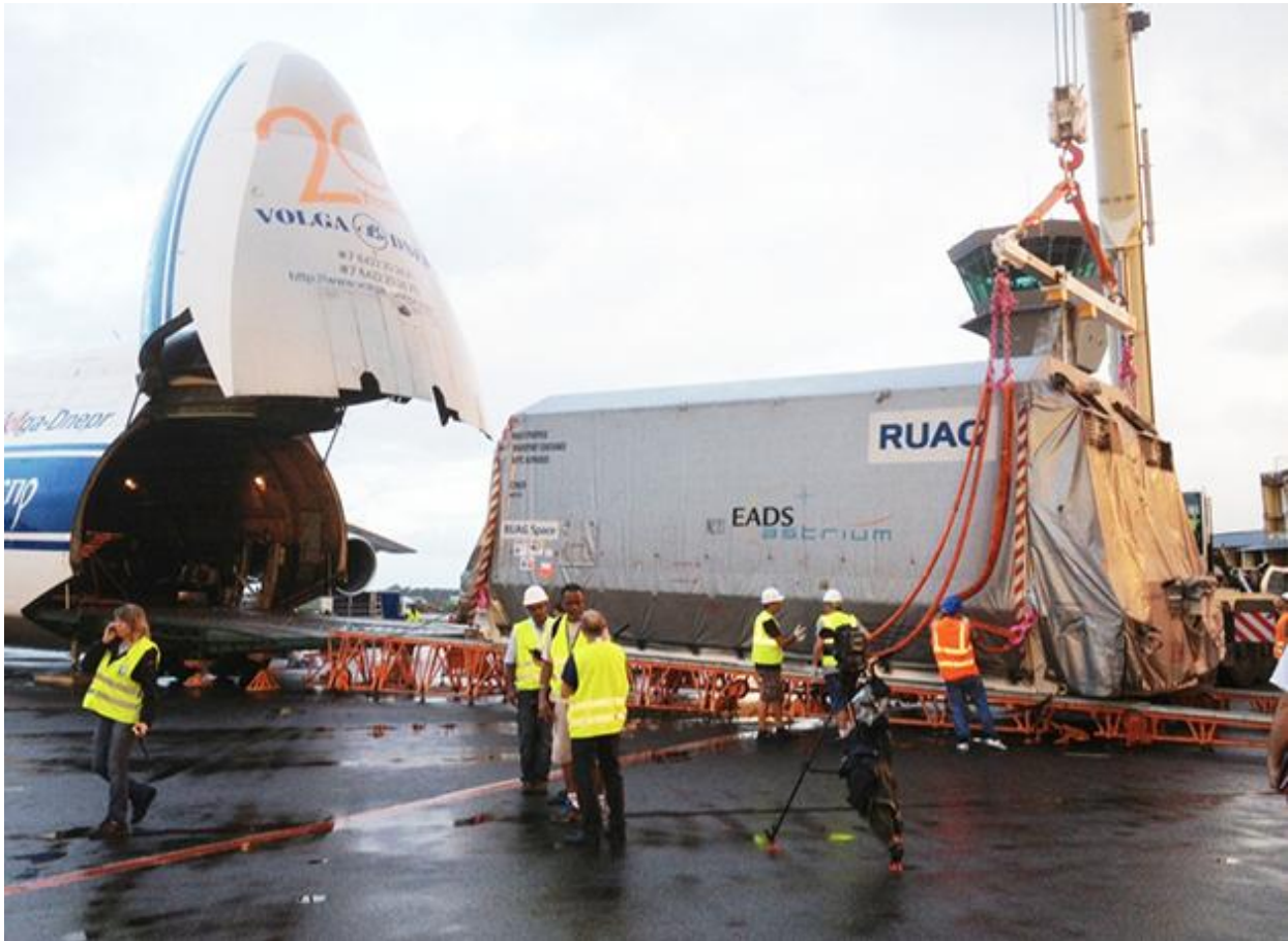
MEASAT-3b safely arrives at the European Spaceport in Kourou, French Guiana.